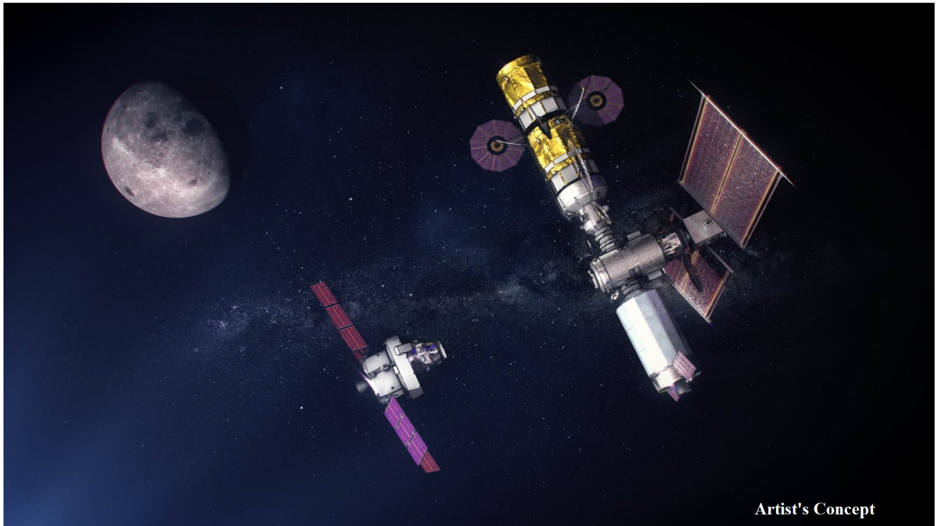
Figure 1. Artist concept of Orion approaching the Gateway with the docked Human Landing System

woman and the next man on the Moon by 2024. The second phase involves establishing a sustained human presence on and around the Moon by 2028. A natural steppingstone to Mars, these efforts will help demonstrate technologies and expand business approaches and commercial opportunities needed for deeper space exploration.