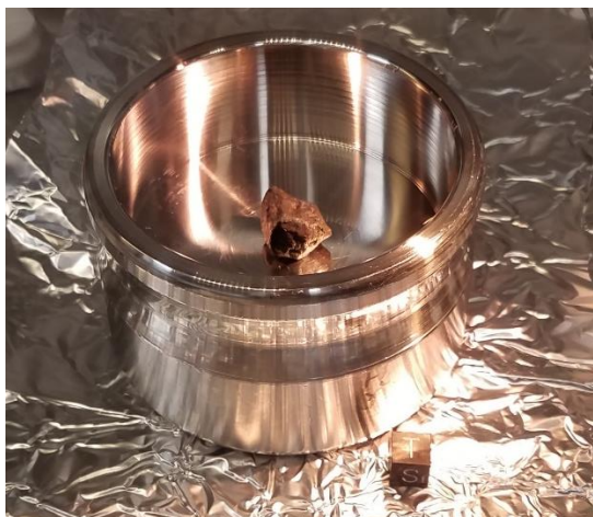
Figure 1. Hamburg meteorite before subsampling at the University of Alberta.

Introduction: The Hamburg meteorite is an H4 chondrite which was collected from the surface of a frozen lake in Michigan shortly after its observed fall on 16 Jan 2018 [1]. During and after collection, the meteorite was stored under clean, cold conditions, thereby minimizing any alteration to the sample. The meteorite was transported to the Johnson Space Center (JSC) where it was stored in a freezer until it was subsampled at the University of Alberta's Sub-zero Facility for the Curation of Astromaterials ( Fig. 1 ) [2]. Subsampling divided the meteorite into predefined target masses for preliminary examination and display purposes. This abstract summarizes the transport and subsampling process, which occurred in October 2019.