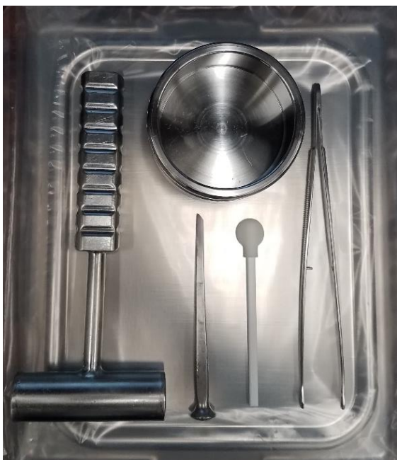
Figure 2. A subset of curatorial tools used to process the Hamburg meteorite.

with temperature monitoring throughout. The swabs were assessed for type and quantity of bacteria and fungus immediately after return to JSC [3]. The preliminary examination subsamples were placed in cold storage while the display subsample was thawed and delivered to JSC sample processors for sectioning and mounting.