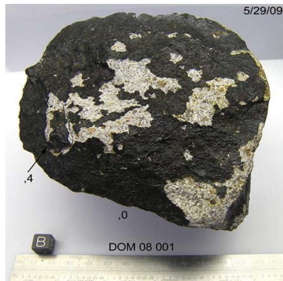
Figure 1: The DOM 08001 brecciated eucrite – a 1.3 kg meteorite.

initially this was identified as an LL shower, additional samples and analysis revealed that it is in fact an L chondrite shower with the olivine content predominantly Fa 25-26 [13]. This shower comprises ~60% of all samples recovered in those two seasons. Nearly 1500 equilibrated ordinary chondrites (EOC) from the Dominion Range have been measured for magnetic susceptibility (Figure 3) using the pocket contact probe SM30 (ZH Instruments). Many of these were also classified by SEM and/or electron microprobe.