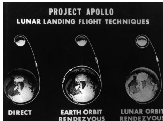
Figure 7. Three principal lunar landing techniques which were proposed for the Apollo program.

The basic concept of LOR was to launch the three required elements, the crew module (CM), the service module (SM), and the Lunar Excursion Module (LEM) into space with one rocket launch. The LEM is designed to descend and land on the lunar surface with the CM remaining in Lunar orbit. Following surface operations, an ascent module launches from the Moon and re-docks with the CM in Lunar orbit for Earth return.