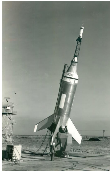
Figure 6. Little Joe test rocket on the launch pad at Wallops in 1960.

In order to gain a complete understanding of atmospheric re-entry performance, it was necessary to get to space and test the performance during a representative re-entry profile. The “Big Joe” test, launched on an Atlas D booster from Cape Canaveral, was conducted as a full-scale mockup of the proposed Mercury spacecraft design. 10 “Big Joe” was designed to conduct ballistic re-entry tests, including the aerodynamics of the capsule design as well as the performance of the ablative heat shield. Big Joe was successfully launched on September 9, 1959, the first launch of a spacecraft under Project Mercury. The flight data from Big Joe ultimately validated the Langley wind-tunnel tests and analytical predictions leading to the eventual suborbital and orbital Mercury flights.