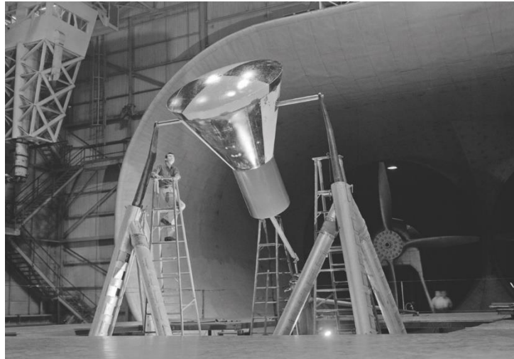
Figure 5. A Mercury capsule in the Full Scale Tunnel in 1959 undergoing testing to assess low-speed performance and stability.

The Mercury space capsule was extensively tested at Langley, including: wind tunnel testing from subsonic to supersonic speeds; rocket-launched models tested from Wallops Station; drop tests of the capsule; impact testing; instrumentation of flight test models; and piloted simulation. 1