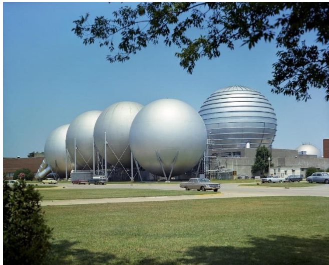
Figure 3. Langley's Gas Dynamics Laboratory with multiple hypersonics test facilities.