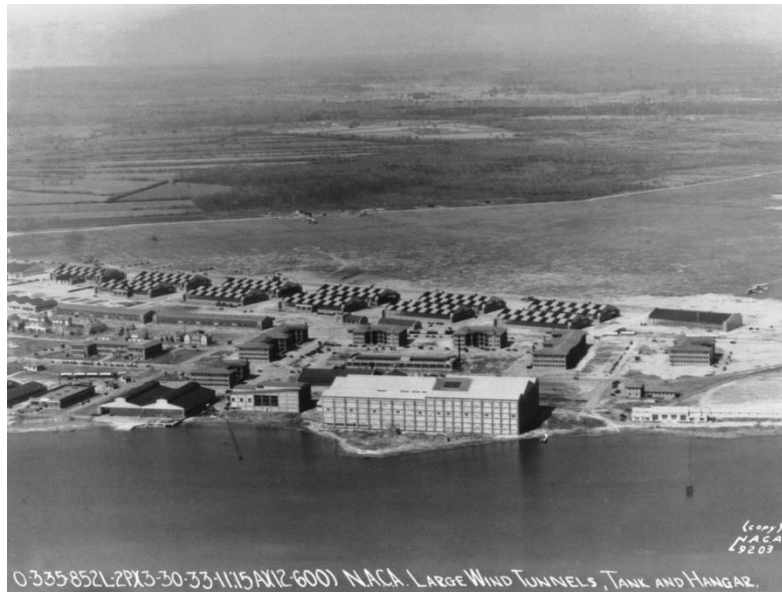
Figure 1. Aerial view of the NACA large wind tunnels, tank and hanger in the foreground, from 1932.

conducted research that led to significant advancements in atmospheric flight and aviation. Through systematic aerodynamic testing, NACA researchers found practical ways to improve the performance of many different varieties of aircraft. 3