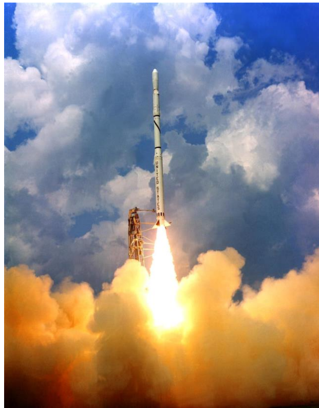
Figure 2. Scout launch vehicle lift off on Wallops Island in 1965.

The four-stage and five-stage solid rocket systems later developed into the Scout program. These rockets were the first systems that could fire stages sequentially to place a small satellite into orbit. 6 The Scout Project Office opened in March 1960 and the first launch of Scout was in July 1960. 2 The Scout Project actually continued through the 1960s and beyond, and on Jan. 1, 1991, management of the Scout Project was transferred to NASA's Goddard Space Flight Center. 7 The focus of the Pilotless Aircraft Research Station expanded to include studies of airplane designs at supersonic flight and gathering information on flight at hypersonic speeds. These tests included aircraft and missile designs from a variety of organizations and corporations.