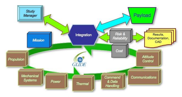
Figure 1. Notional Compass Design Session Process

This paper is a retrospective of the lessons learned during the almost 15-year history of the Compass concurrent mission and systems design team at NASA's Glenn Research Center (GRC). It examines the key factors in the team's evolution from a temporary group gathered to perform a single study to the successful, sustainable team it is today. Compass is a matrixed team of experts with various technical backgrounds and personalities. They collaborate over a two-week period either physically in a dedicated meeting space, or virtually to design a space system (Spacecraft, stage, science package, etc). Over the years, because of the rapid nature of the design studies, the team leadership has iterated on the optimal team member personality makeup, facility elements and tools as well as NASA GRC management support necessary to lead to sustained success.