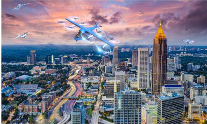
Fig. 1. Urban Air Mobility (UAM) notional mission for the masses.

may no longer be valid, and the role of the human is that of an operator. The vehicle may encounter disturbances (e.g., weather events) and disruptions (e.g., restricted airspace or weather) in the course of its journey, and may have to deal with contingencies (e.g., faults and failures) in an increasingly autonomous fashion.