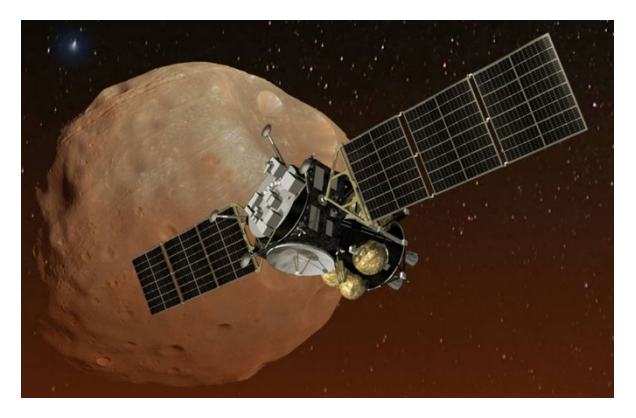
Fig 1. The Martian Moons eXploration (MMX) mission, developed by the Japanese Aerospace Exploration Agency (JAXA).