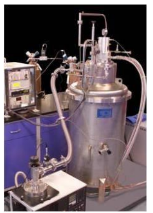
Figure 1: Cryocooler mounted on top of a tank.