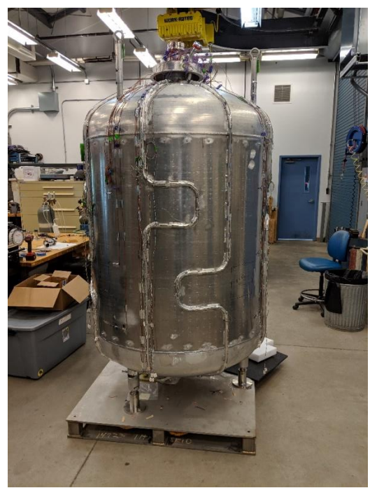
Figure 3: Tank with tubes welded to the tank wall.