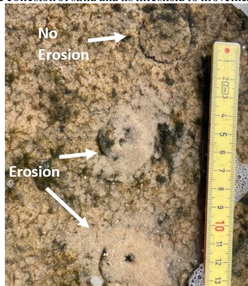
Figure 2: Three different CSM erosion tests on same surface. In the tests where the surface failed a clear puncture in the mat can be seen. This test was performed in ~3 cm of water.

SWERL housing is a cylinder 39 cm in internal diameter and utilizes an annular blade to generate a shear stress on the surface [6]. A suite of optical gate sensors are used to count entrained particles larger than 90 \mu\text{m} [7]. When the number of grains counted by the sensors increases steadily above the level of noise in the sensor it is determined that erosion has initiated. The annular blade rpm can then be converted to a threshold friction velocity ( u^* ) [6,7]. Tests began with the fan blade at 0 rpm and increased steadily to 6000 rpm over 5 minutes. Measurements were performed on a collection of different microbial mat and crust structures. Dune sand was also tested in the field, dried, and tested again in the lab to understand influence of humidity on the cohesion of sand and its threshold to movement.