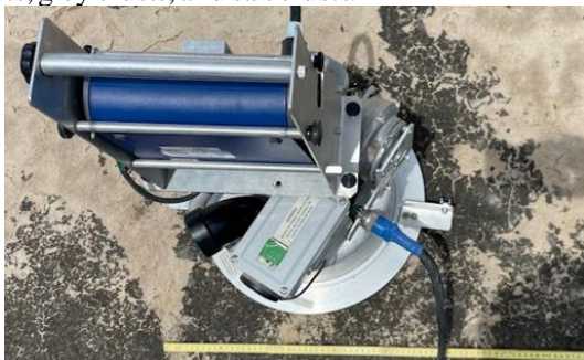
Figure 1: PI-SWERL on 'boundary mat' during erosion test.

Methods: The Padre Island study site features a variety of microbial mat and crusts within tidal flats and interdune areas. These areas experience a mix of aeolian and subaqueous erosion as they fluctuate between subaerial and flooded states. To determine the effect of water and wind shear on the mats, two erosion detection instruments were deployed during relevant field states (dry and flooded). We classified 5 different mats and crusts at Padre Island for this work. These included wave rippled mats, boundary mats, degraded mats, grey crusts, and salt crusts.