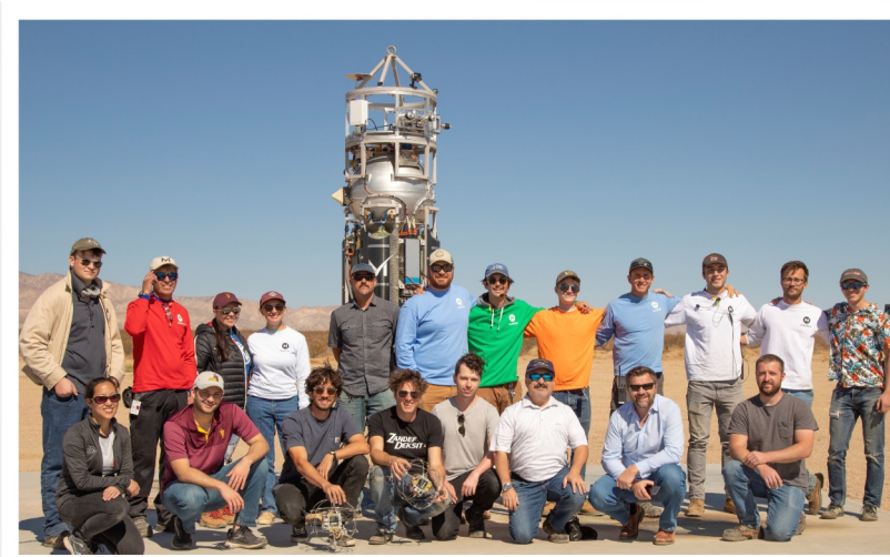
Lunar ExoCam flight and support team, following first successful ejection of a remote payload from an in-flight terrestrial rocket!