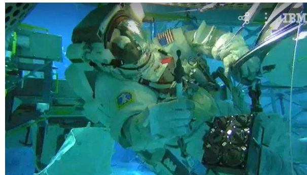
Fig. 2. Testing the modified ISS External Microorganisms demonstration sampling kit (lower right on tether) in NASA's Neutral Buoyancy Lab during an EVA practice run.