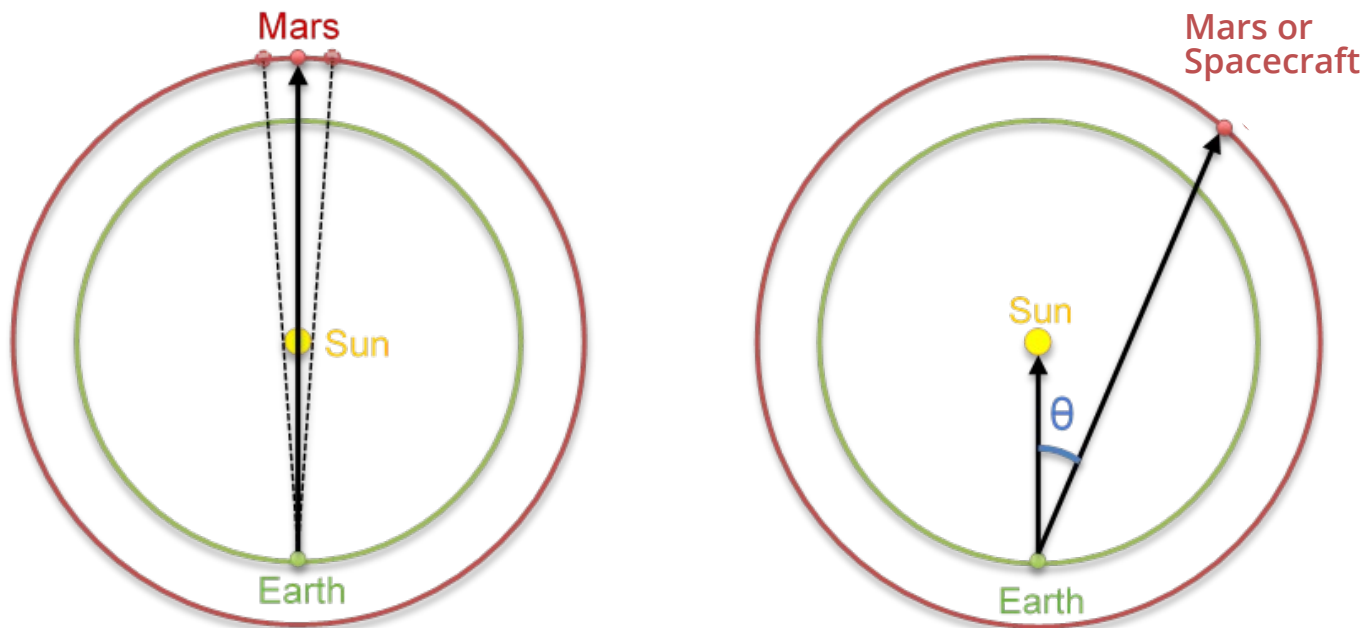
Figure 1. This diagram illustrates Earth-Sun-Mars conjunctions creating line-of-sight disruption between Earth and Mars (left) and the angle definition for communications disruption analysis (right).

For the initial assessment of the blackout period during Mars missions, NASA assumed a \theta value of 2^\circ based on the current understanding of communications protocols and their susceptibility to signal disruptions. However, higher bandwidth communications protocols may have higher sensitivity to disruptions and could have a higher \theta value.