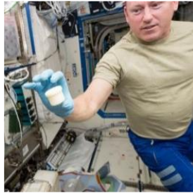
Commander Butch Wilmore holds 3D printed container on ISS.

ISM began with the 3D Printing in Zero-G Technology Demonstration, which was the first time that additive manufacturing was performed on the International Space Station (ISS) and was performed under a Small Business Innovative Research (SBIR) contract with Made In Space, Inc. (MIS), now Redwire Space, Inc. The samples were fabricated using Fused Deposition Modeling (FDM) of polymers and were returned to NASA's MSFC