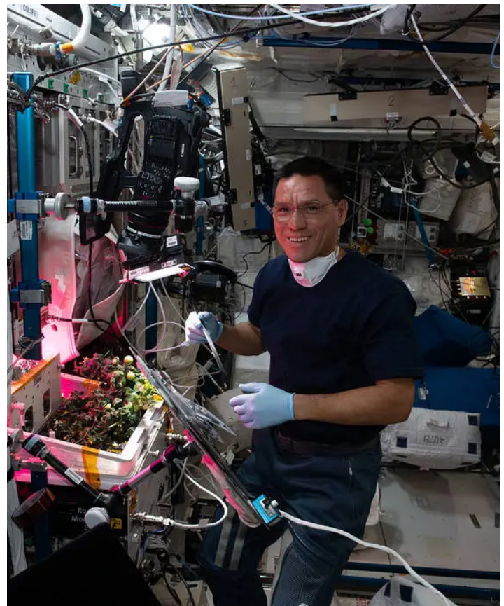
Figure 3. Astronaut Frank Rubio checks tomato plants growing inside the International Space Station for the XROOTS space botany study.

The eXposed Root On-Orbit Test System (XROOTS) experiment uses aeroponic and hydroponic systems to grow fresh food without space-consuming growth media. XROOTS grows plants in the microgravity environment and evaluates nutrient delivery and recovery techniques over the course of a full plant growth cycle, from germination to maturity. The system uses multiple independent growth chambers in parallel to evaluate alternative methods and configurations; the results could lead to large-scale food production systems. This would offer reductions in the weight requirements for such systems and fresh food produced in-situ, allowing more room for other valuable cargo.