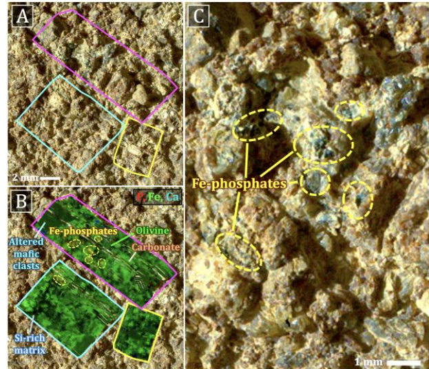
Figure 1: WATSON images and PIXL XRF maps showing the location of the blue-green Fe-phosphate minerals in Ouzel Falls. Approximate footprints of the PIXL scans are shown in A & B.

Peak) was collected from the same stratigraphic and lithological unit as Onahu on Sol 882