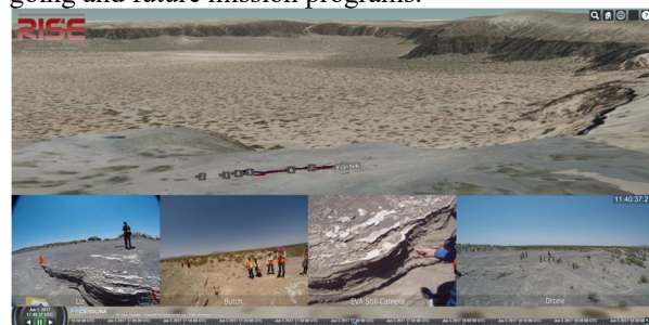
Figure 1 The RIS4E prototype featuring GPS tracks, two crew audio/video feeds, crew still camera, overhead drone and XRF data in context

RIS4E Prototype: By aligning voice, image, video data, and geologic data in a searchable, synchronized framework, the Apollo in Real Time project showed the potential to apply this methodology to field analog data to establish scientific context. When co-authors Bleacher and Whelley became aware of Apollo in Real Time in 2016, they invited co-author Feist to participate in RIS4E field operations. Feist subsequently built the RIS4E data visualization prototype. The positive outcome from this prototype played an important role in gaining acceptance for the concept at JSC to support ongoing and future mission programs.