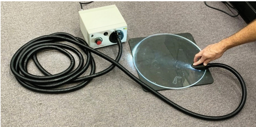
The delivered SLOT using a 20-foot length of multimode fiber and remote light supply.

Key to the SLOT's functionality is its optical head, designed to couple light into a window at an angle that ensures total internal reflection. This component was meticulously crafted from optically clear acrylic, with careful attention to the angles and materials used to optimize light transmission. The optical head's design prevents light from escaping or causing distractions, ensuring efficient and effective window inspections. The SLOT system, with these enhancements, continues to be a valuable tool for maintaining the integrity of spacecraft windows.