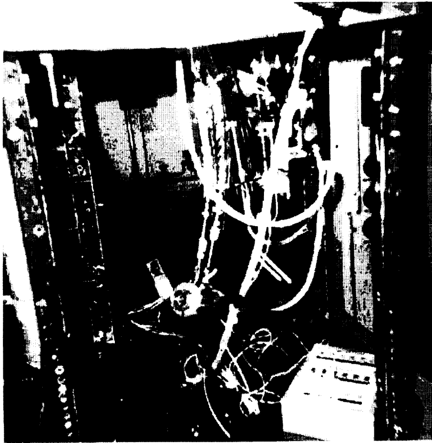
Figure 2 – Photograph of Thermal Vacuum Chamber

Figure 2 displays a photograph of the set-up in the thermal vacuum chamber.