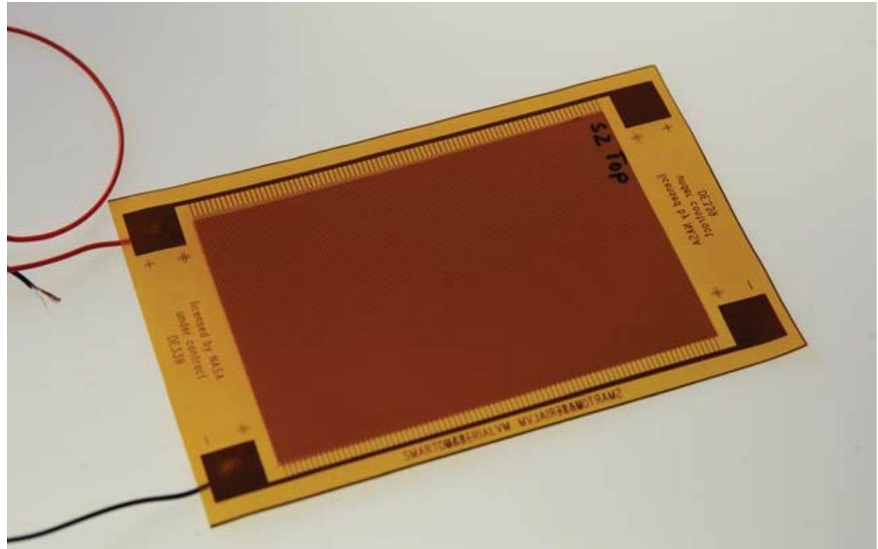
The Macro-Fiber Composite's flat profile and use as a sensor and an actuator allows for use in critical or tight areas where other technologies with larger volumetric profiles cannot be used.

The MFC's combination of small size, durability, flexibility, and versatility allows it to be integrated—along with highly efficient electronic control systems—into a wide range of products. Potential applications include sonar; range-measuring and fish-finding equipment; directional-force and fingerprint sensors; flow meters; and