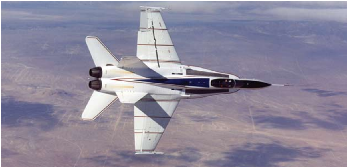
Dryden Flight Research Center's Active Aeroelastic Wing aircraft shows off its form during a research flight.

ZOFÉ is in use by the U.S. Air Force for special projects for testing flutter suppression and innovating new kinds of air vehicles. Major aircraft manufacturers are also testing the product.